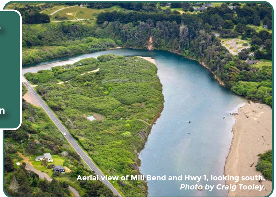
Aerial view of Mill Bend and Hwy 1, looking south.

Stepping forward at a critical point, our interim conservation buyer The Allemall Foundation purchased the property to give RCLC the time needed to identify sources for permanent funding.