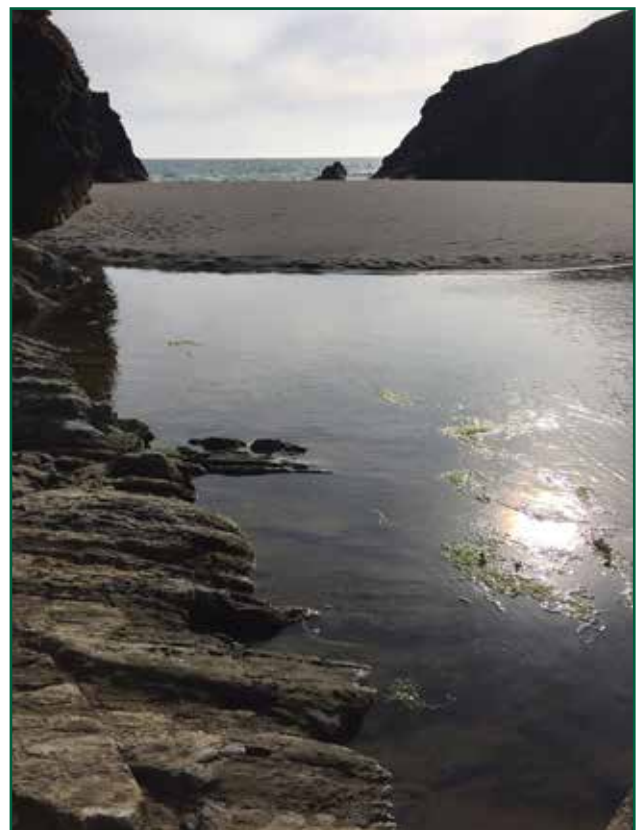
Hearn Gulch Beach

Projects of the Collaborative include a uniformed officer training program and marine protected area outreach and education to be provided to schools, councils, clubs and associations in Mendocino and Lake Counties. Part of the group’s mission is to create effective, transparent, grassroots stewardship of California’s marine protected areas. The Collaborative has installed signs in several key locations along the coast to assist the public and law enforcement in identifying MPA boundaries from land.