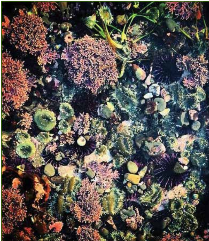
Reefs in the Marine Sanctuary contain a rich diversity of sea life.

We look forward to RCLC’s continued participation with the Point Arena Gateway group and are thrilled to be part of the protection of this beautiful and important landscape.