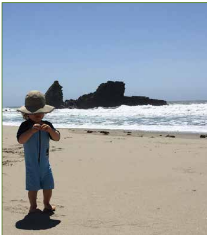
Children love Cooks Beach