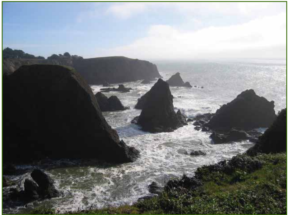
The waters off Hearn Gulch are in the center of the Saunders Reef State Marine Conservation Area, an impressive rocky reef and bull kelp habitat.