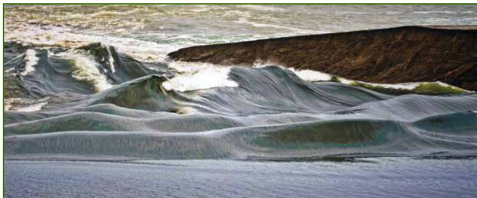
Sandbar Opening from Bluff Trail - photograph by Rozann Grunig, 3rd place

"We were pleased with the wonderful entries submitted for this exhibit inspired by the three public access locations. Almost every entry was chosen by someone as one of their three favorites. Although the voting for second and third place was close, the clear winner was "The Bridge," a graphite drawing by Ginger Thompson-Veys. Her drawing shows the bridge over the swale on the Gualala Bluff Trail that was built by volunteers. It is a familiar sight to those who walk the trail. In second place was "The Art of Perseverance," my photo book of images taken between 2005 and 2014 on the Gualala Bluff Trail as the second phase of the Gualala Bluff Trail was started, delayed and finished. The favorite in third place was a photograph taken by Rozann Grunig entitled "Sandbar Opening from Bluff Trail" showing the Gualala River breaking through to the ocean."