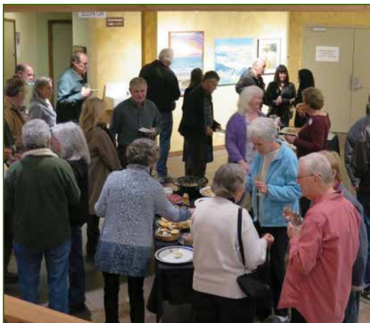
Grand Opening of Artistic Celebration of RCLC Public Access