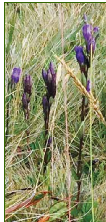
Wildflowers at the Point Arena-Stornetta Unit of the California Coastal National Monument

With your help we can expand our participation in California Coastal Cleanup Day in future years. Thank you to all our beach captains and volunteers who participated in 2015!