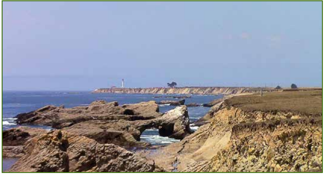
Point Arena-Stornetta Unit of the California Coastal National Monument

RCLC has been an active official partner working with the Point Arena Gateway Group of the California Coastal National Monument (CCNM) for several years now. Partners in this group include the Point Arena-Manchester Band of Pomo Indians, Mendocino Audubon Society, California Native Plants Society, Acorn Partners in Education, the City of Point Arena, to name just a few. The United States Bureau of Land Management manages the land and is in the process of amending the Resource Management Plan.