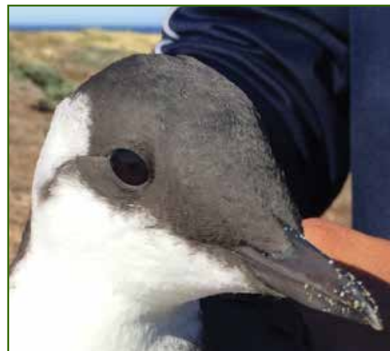
Common Murre Rescued on Cooks Beach

Beach “captains” greeted volunteers and distributed citizen science materials that volunteers used to quantify all of the items collected. Most local beaches were quite clean and this can be attributed to good stewardship throughout the year. All in all, Mendocino County cleaned up 5,000 pounds of trash on Coastal Cleanup Day.